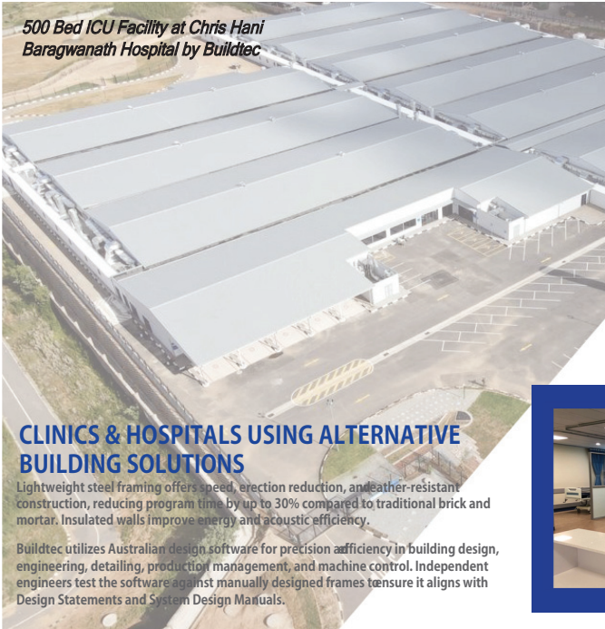
500 Bed ICU Facility at Chris Hani Baragwanath Hospital by Buildtec